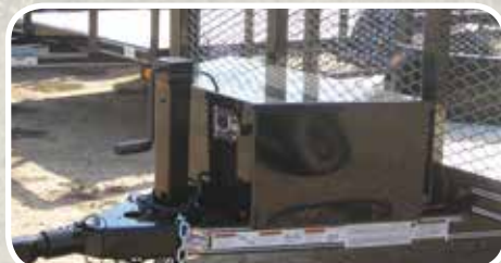
Front Tongue Mount Toolbox w/Gas Shock