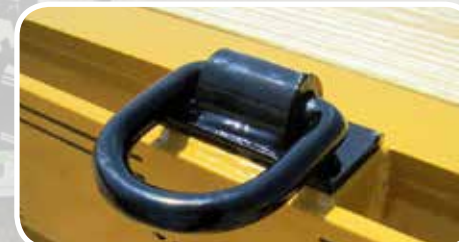
M19 - D-Ring