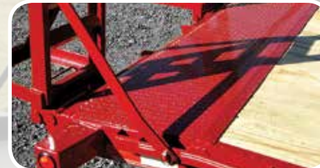
2" Diamond Plate on Dove Tail