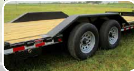
Heavy Duty 10" Fenders