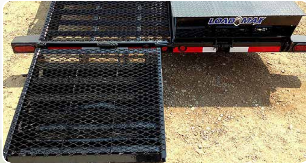
MAX Ramps W/Expanded Metal