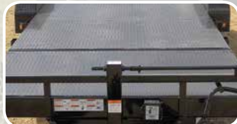
Steel Floor DP