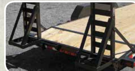
Fold Up Ramps 5' x 16"